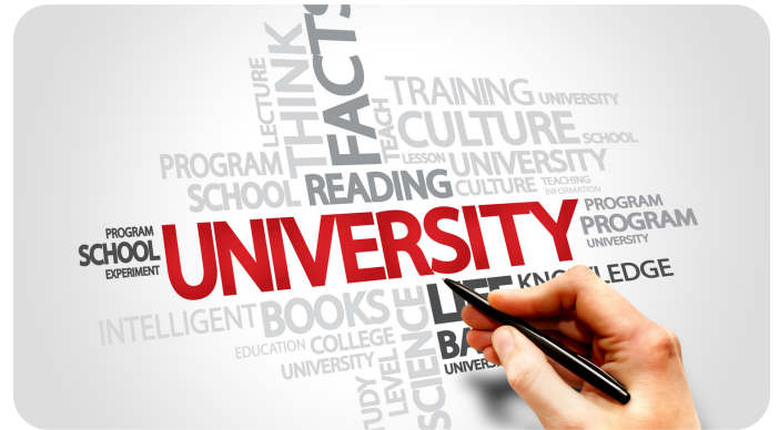
NAME UNDER NDA